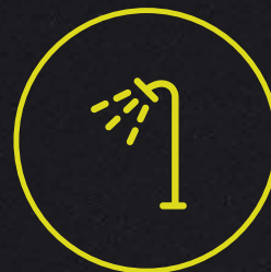
NEW WC'S AND SHOWER FACILITIES