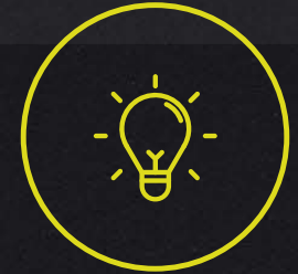
LED LIGHT FITTINGS