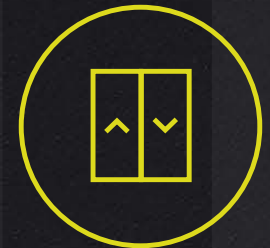
DDA COMPLIANT WITH EXTERNAL RAMPS AND INTERNAL PASSENGER LIFT