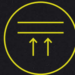
MODERN SUSPENDED CEILING