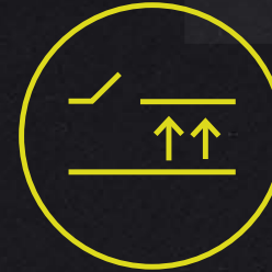
FULL ACCESS RAISED FLOORS