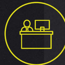
REFURBISHED RECEPTION / COMMON AREAS