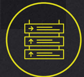
PROMINENT SIGNAGE OPPORTUNITIES