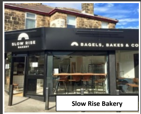
Slow Rise Bakery