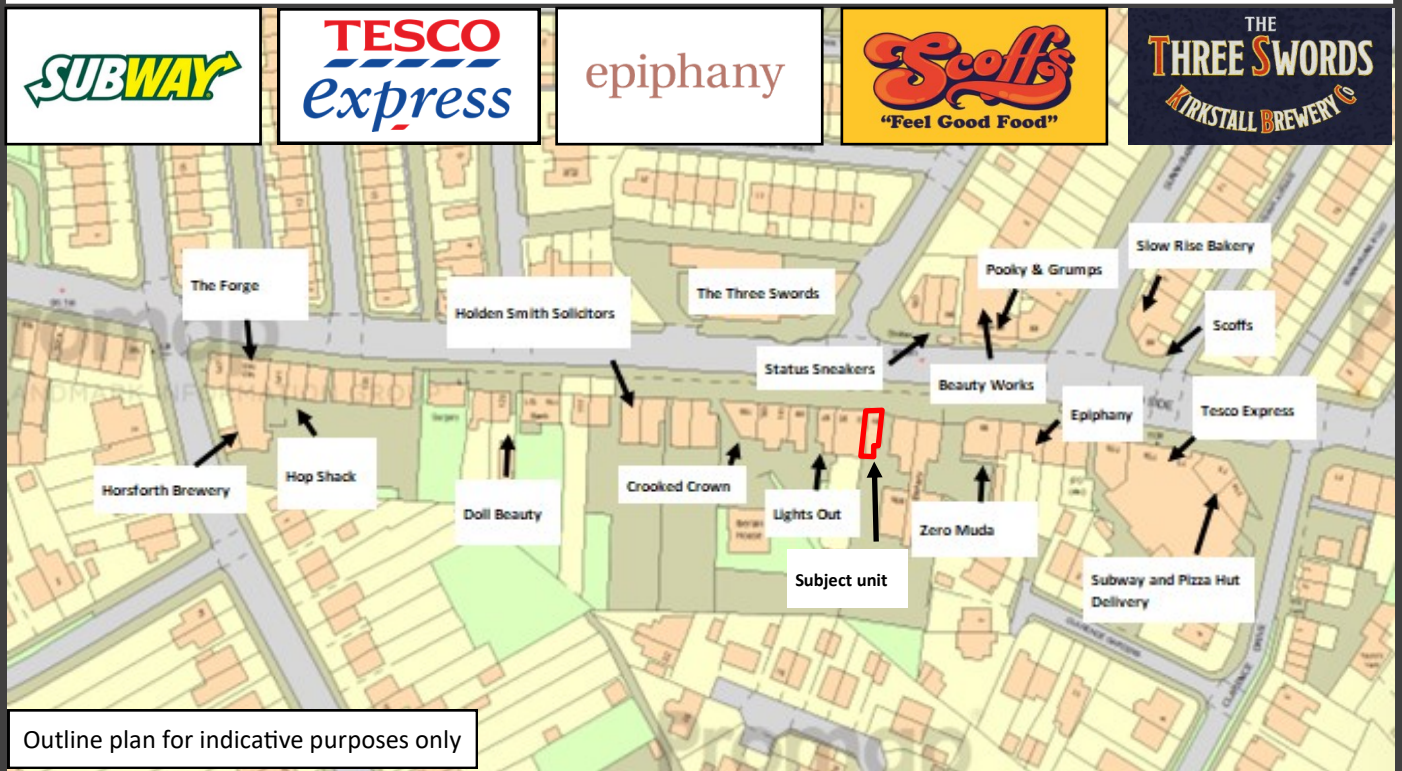
Outline plan for indicative purposes only

The property will provide a single demise with an entrance onto New Road Side.