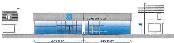
Alness : Proposed Front Elevation