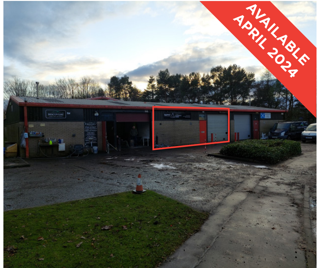
Unit N, Scott Way Pearce Avenue, West Pitkerro Industrial Estate Dundee, DD5 3RX