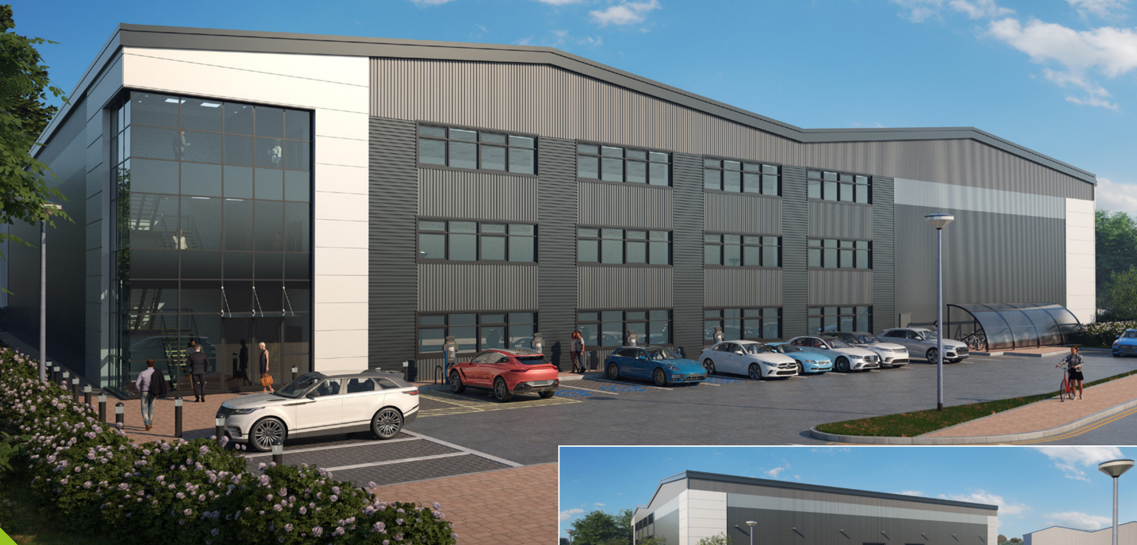
CGI image of the development