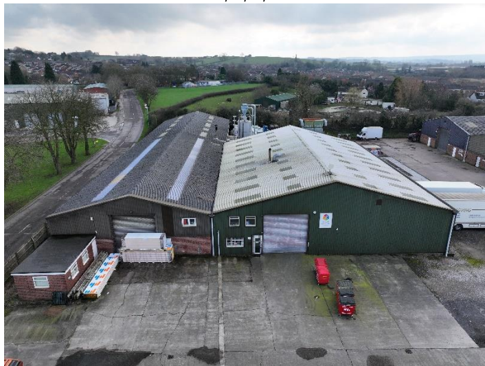
Units 8, 8a & 9