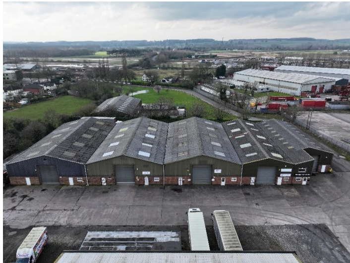
Units 1, 2, 3, 4 & 4a