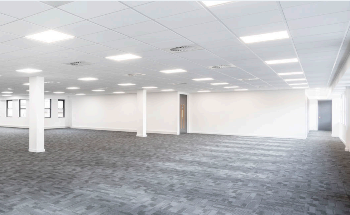
Above: Refurbished open plan office space.