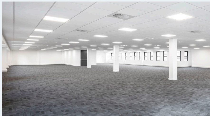
Top: Refurbished ground floor reception.