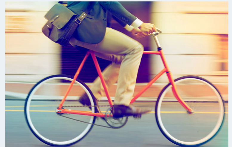
Top: Winchester Christmas market with stalls lining the high street. Middle: Enjoying a coffee at one of the many restaurants and cafés. Above: The smart way to get about in Winchester.