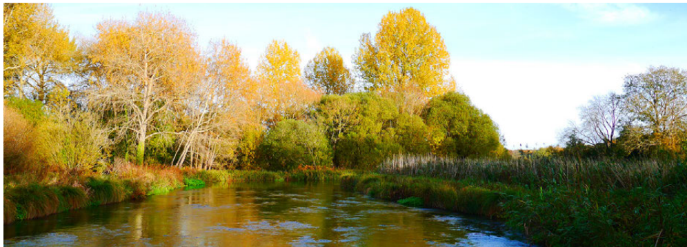
Above: Winchester water meadows.

Wykeham Court is positioned just a five-minute walk from Winchester Train Station. From there London Waterloo is only 70 minutes away and Southampton Central Station just a 20-minute train ride. This makes Wykeham Court ideally located for commuting and enables businesses to successfully cast their employment net further afield ensuring a reliable source of qualified and experienced employees who want to work in Winchester.