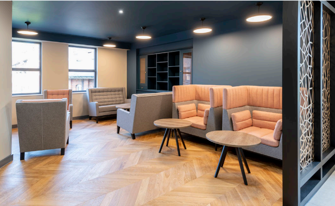
Above: Refurbished ground floor meeting area.