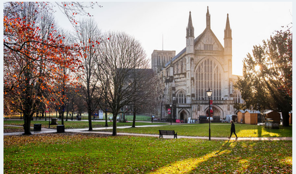
Top: Entrance to Wykeham Court. Above: Winchester Cathedral.