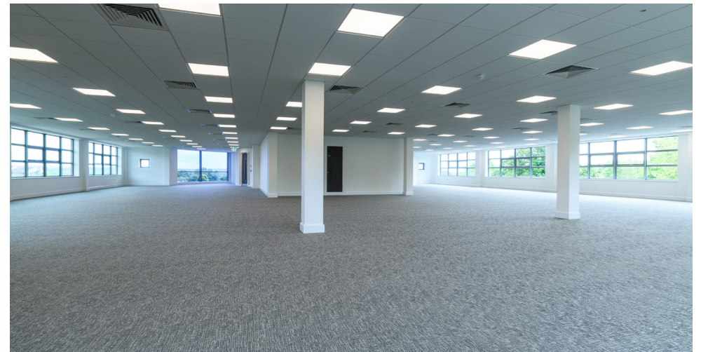
First Floor: 6,166 sq ft (572.84 sq m) Now Under Offer