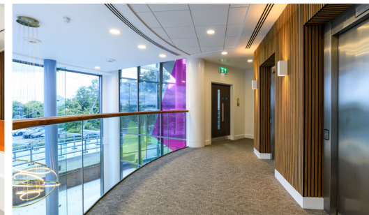
Landings on each floor