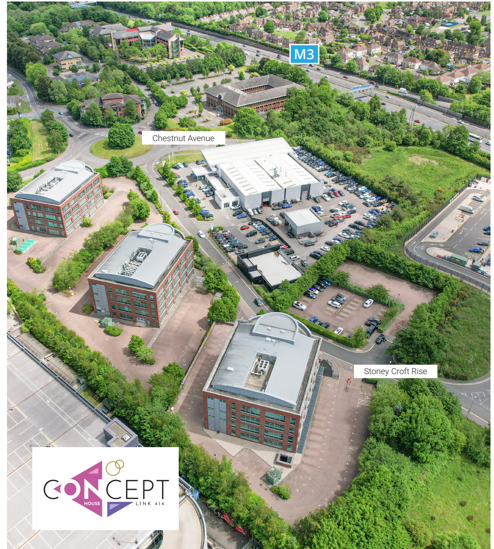
Looking west over Concept House showing the close proximity to the M3.