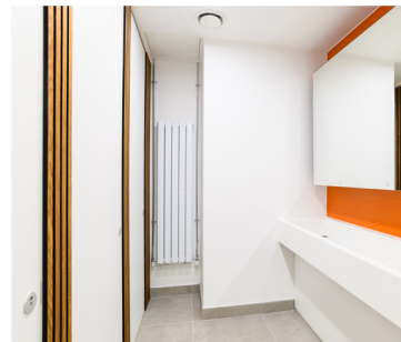
Washrooms on each floor