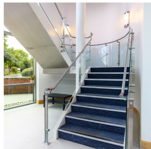
Stairs from the atrium