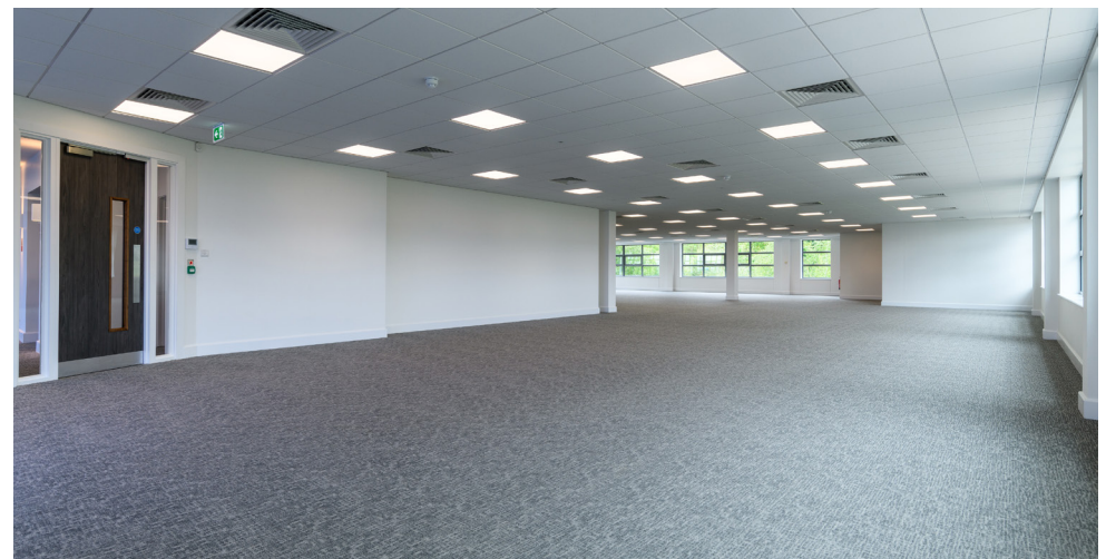
Ground Floor: 5,992 sq ft (556.68 sq m) Ready for Occupation