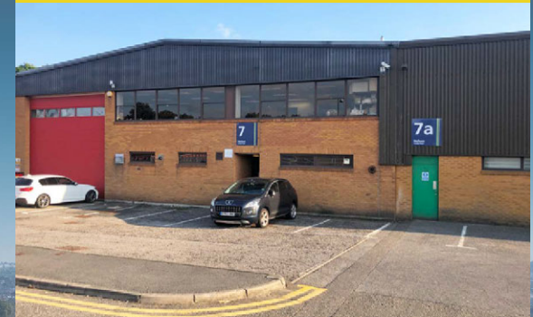
MORDEN ROAD, LONDON, SW19 3BL