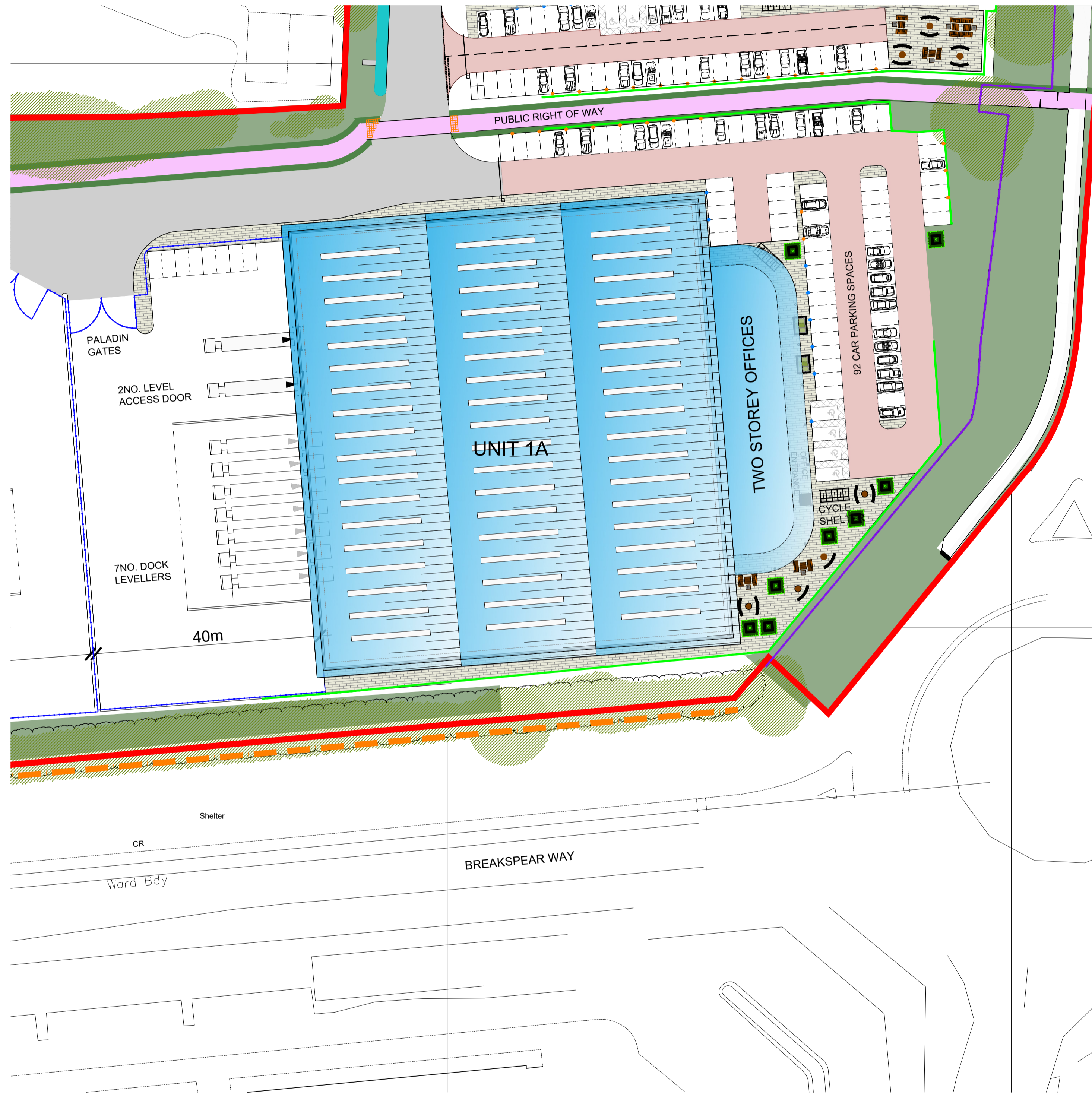
01 UNIT 1A SITE LAYOUT 211 1:500

NOTES: SUBJECT TO STATUTORY CONSENTS SUBJECT TO SURVEY BASED ON OS MAP REPRODUCED BY PERMISSION OF CONTROLLER OF HM STATIONARY OFFICE (c) CROWN COPYRIGHT COPYRIGHT RESERVED FOR PLANNING PURPOSES ONLY INDIVIDUAL TREE LOCATIONS SHOWN FOR ILLUSTRATIVE PURPOSES ONLY DO NOT USE ELECTRONIC VERSIONS OF THIS DRAWING TO DETERMINE DIMENSIONS UNLESS SPECIFICALLY AUTHORISED BY MICHAEL SPARKS ASSOCIATES IF USING AN ELECTRONIC VERSION OF THIS DRAWING FIGURED DIMENSIONS TAKE PRECEDENCE AND NOTIFY MICHAEL SPARKS ASSOCIATES OF ANY DISCREPANCIES