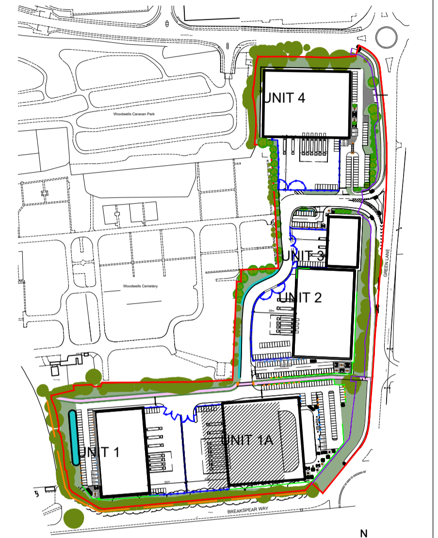
02 KEY PLAN 211 NTS