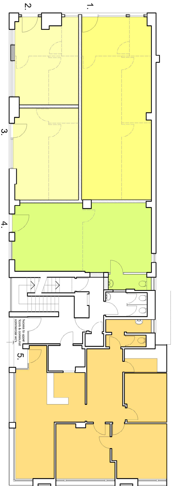
Proposed ground floor plan Scale 1:100 @A3