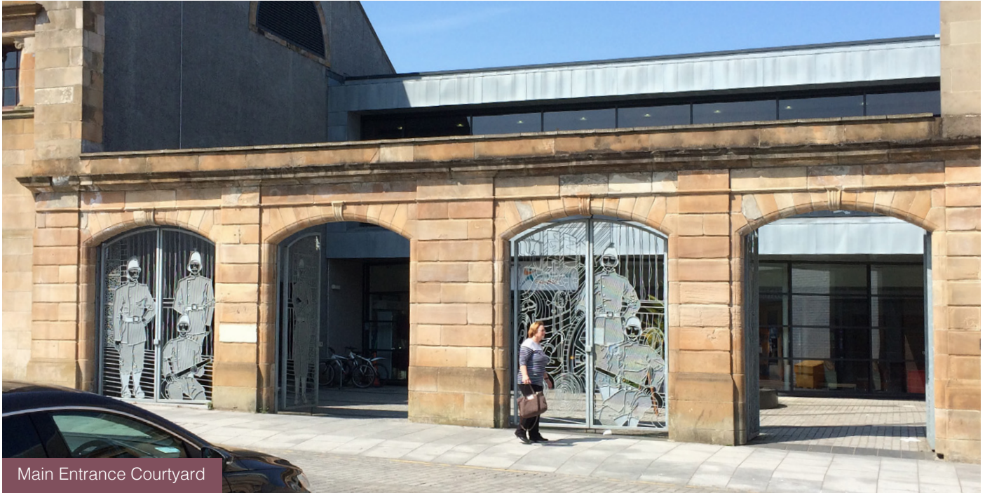
Main Entrance Courtyard