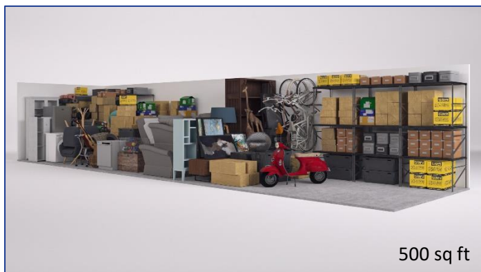
500 sq ft

FOR FURTHER INFORMATION OR TO ARRANGE A VIEWING PLEASE CONTACT