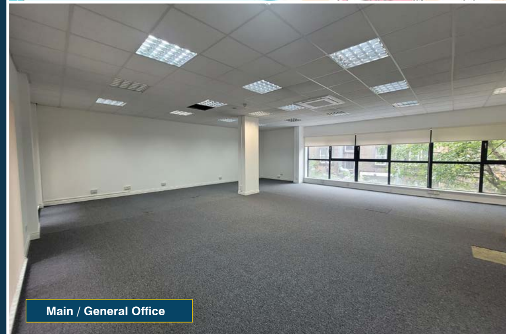
Main / General Office