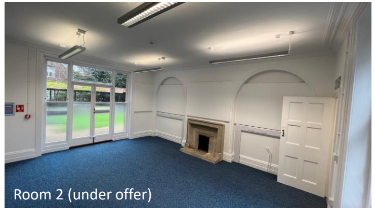
Room 2 (under offer)