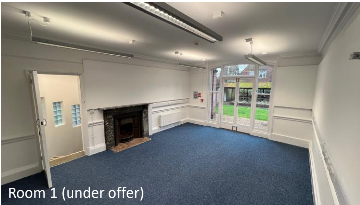
Room 1 (under offer)