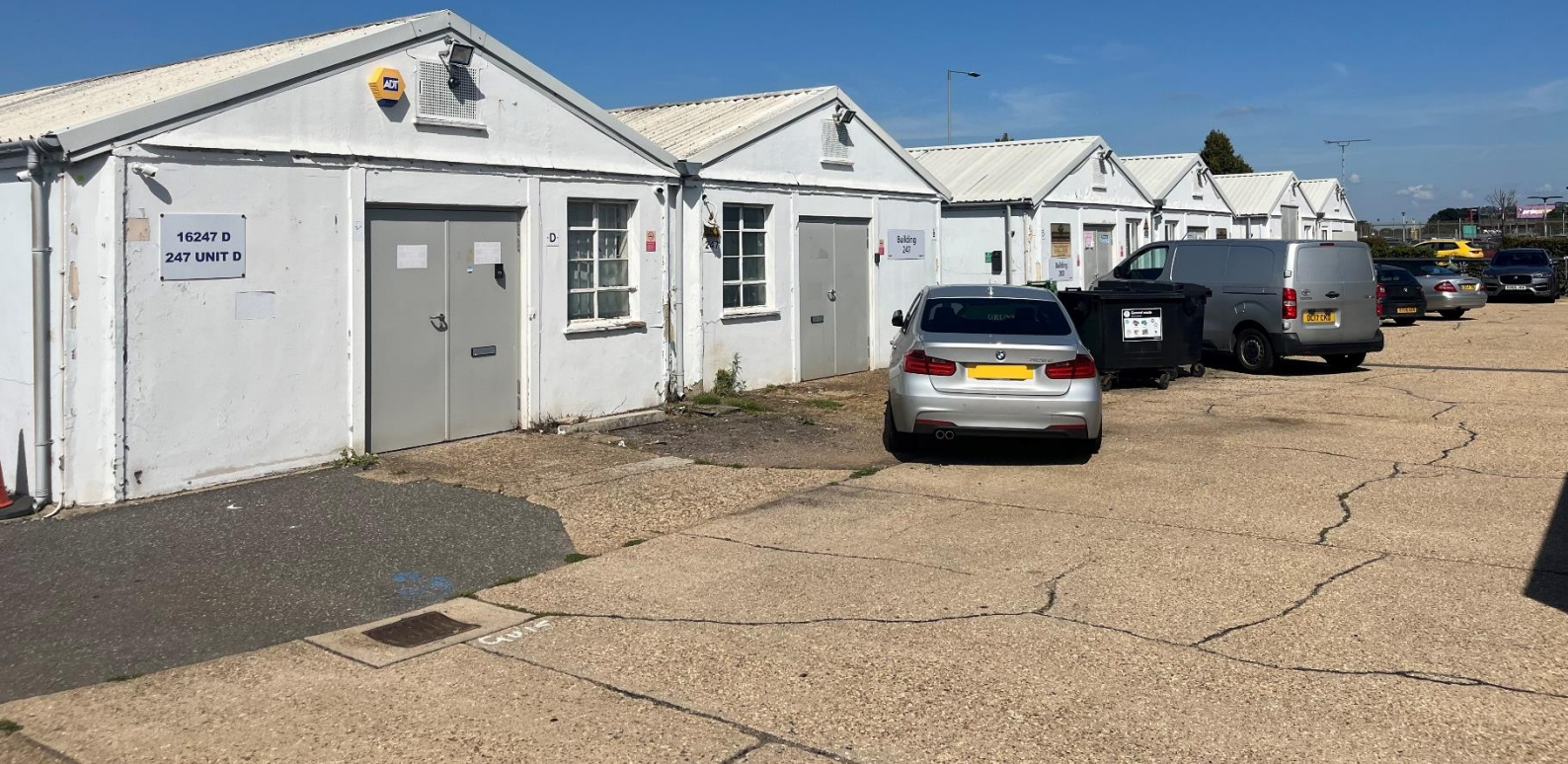
Indicative warehouse photo