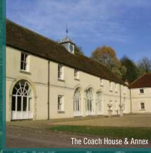
The Coach House & Annex