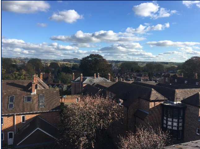
View from the office window

There is the potential for car parking on a short term basis by way of separate negotiation.