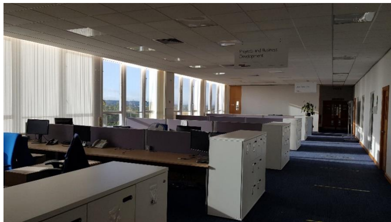
Indicative photos of possible layout