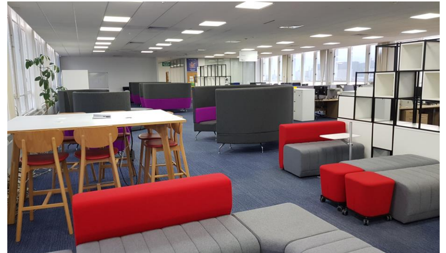
Indicative photo of possible layout