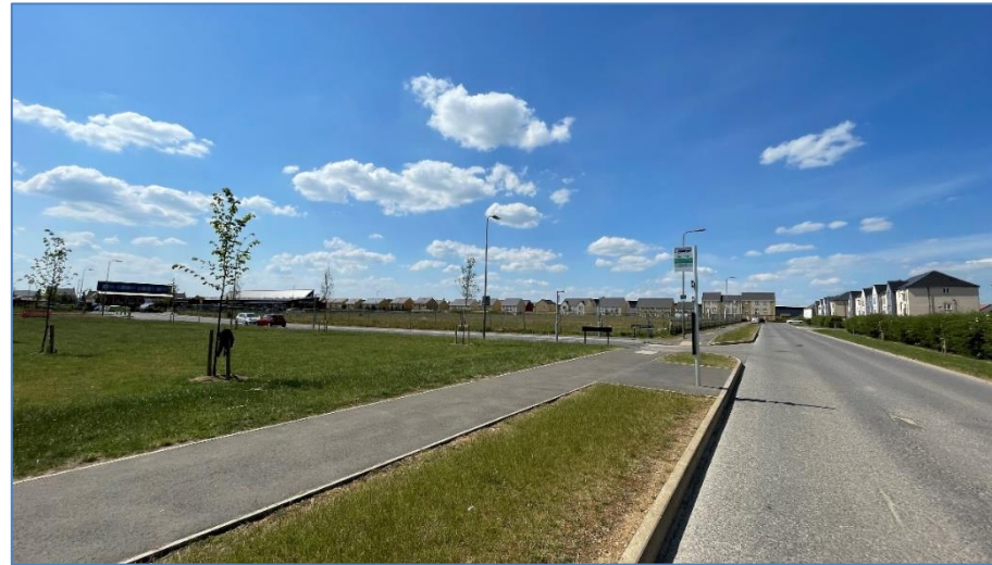
View from Centenary Way (from South of site towards North-West).