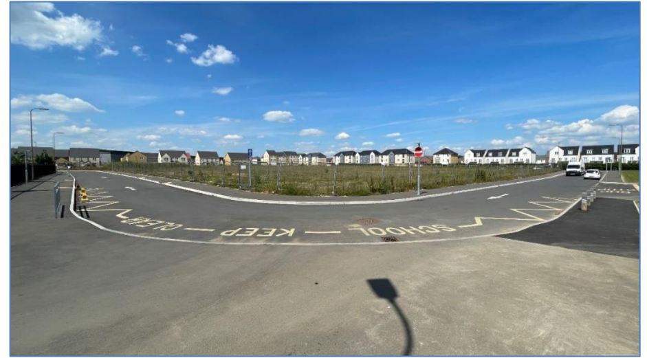
View from school entrance (from South corner towards North).