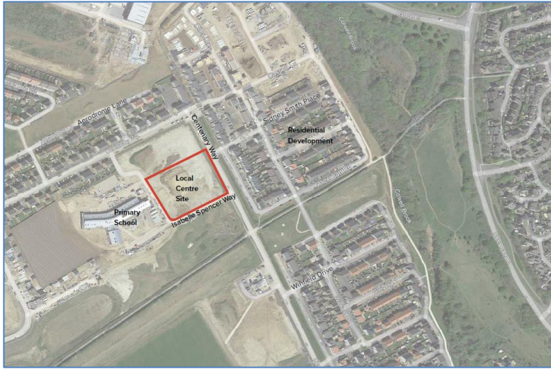
Aerial view (note: the view does not show latest developments)