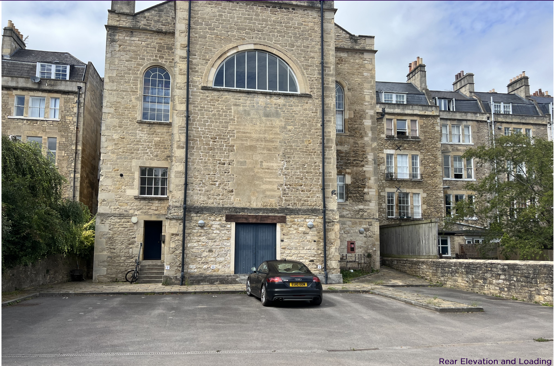
Rear Elevation and Loading

LOWER GROUND FLOOR OF KENSINGTON CHAPEL, KENSINGTON PLACE, BATH, BA1 6AW