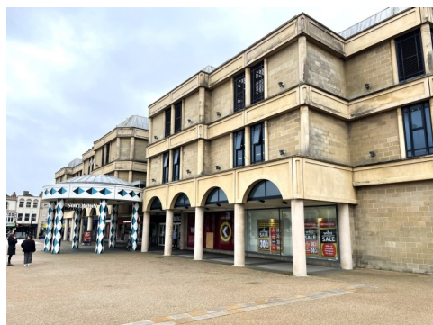
Italian Gardens Façade

For details of other opportunities in The Sovereign and other commercial properties marketed through this firm please visit: carterjonas.co.uk/commercial