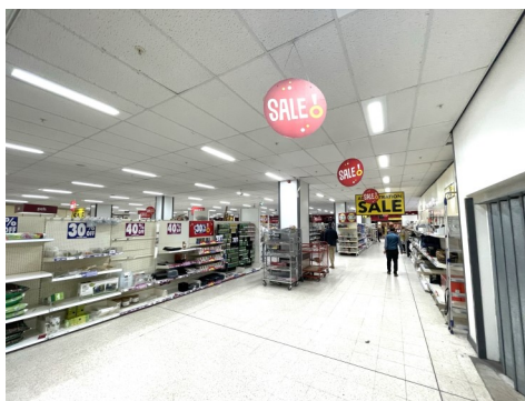
Ground floor sales