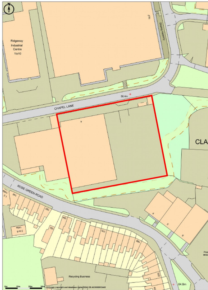
Promap © Crown Copyright and database rights 2024. OS AC0000813445 LANDMARK INFORMATION Plotted Scale - 1:1250. Paper Size - A4