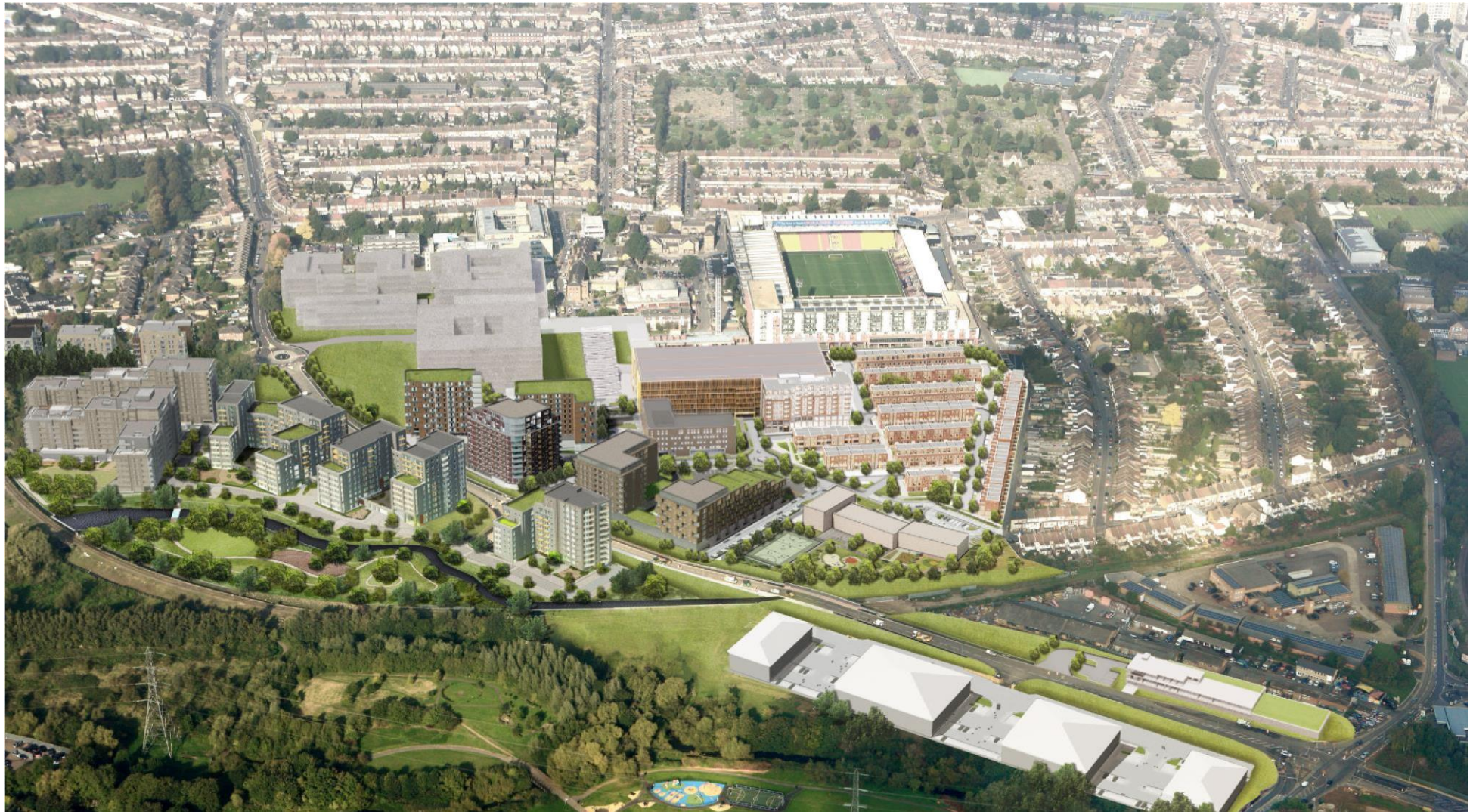
*Image for illustrative purposes only

Community Centre, Watford Riverwell Thomas Sawyer Way, Watford, WD18 0GS