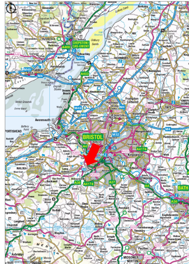
Promap © Crown Copyright and database rights 2024. OS AC0000813445 LANDMARK INFORMATION Plotted Scale - 1:250000. Paper Size - A4