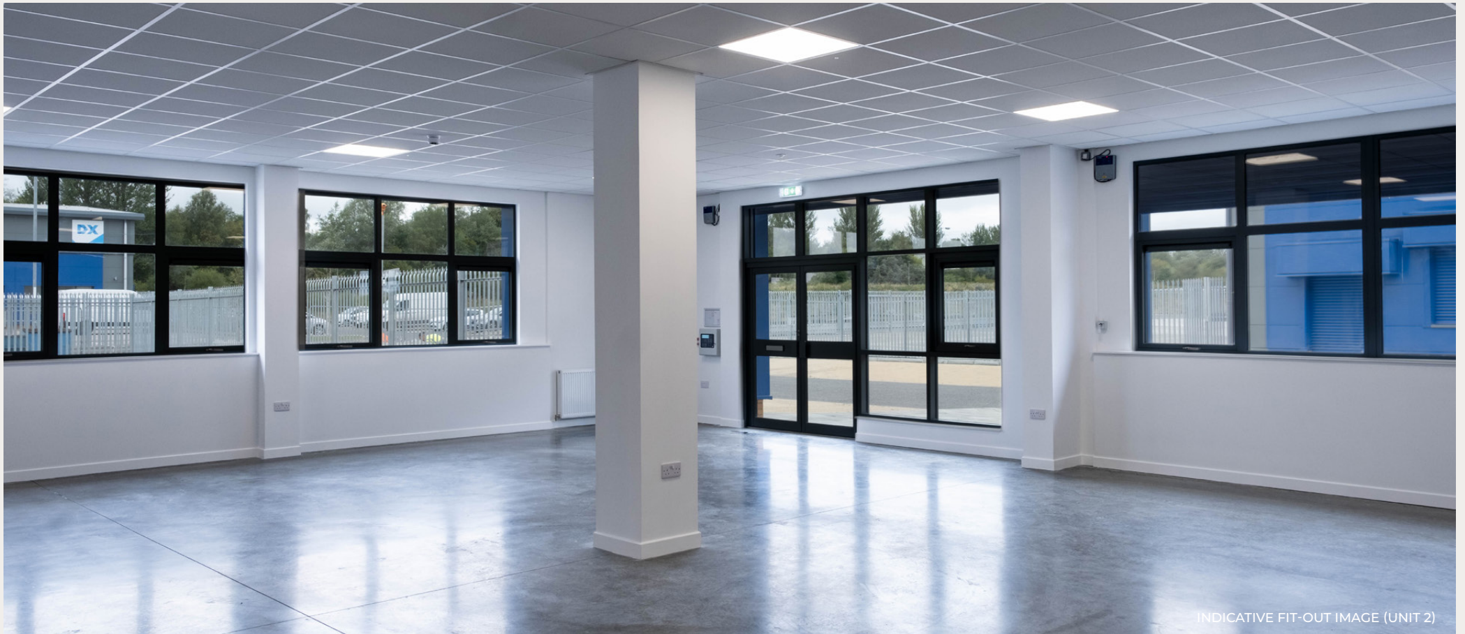
INDICATIVE FIT-OUT IMAGE (UNIT 2)