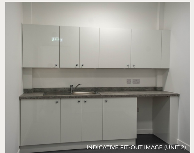
INDICATIVE FIT-OUT IMAGE (UNIT 2)

New high specification distribution/production unit of approximately 24,748 sqft