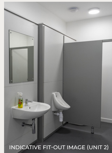
INDICATIVE FIT-OUT IMAGE (UNIT 2)