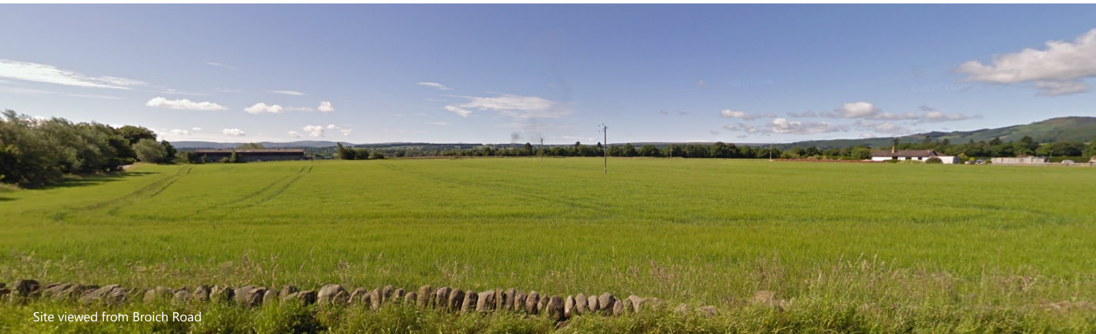
Site viewed from Broich Road