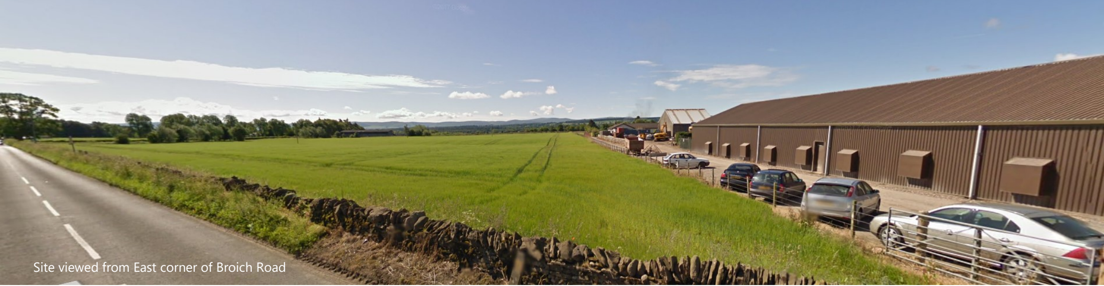
Site viewed from East corner of Broich Road