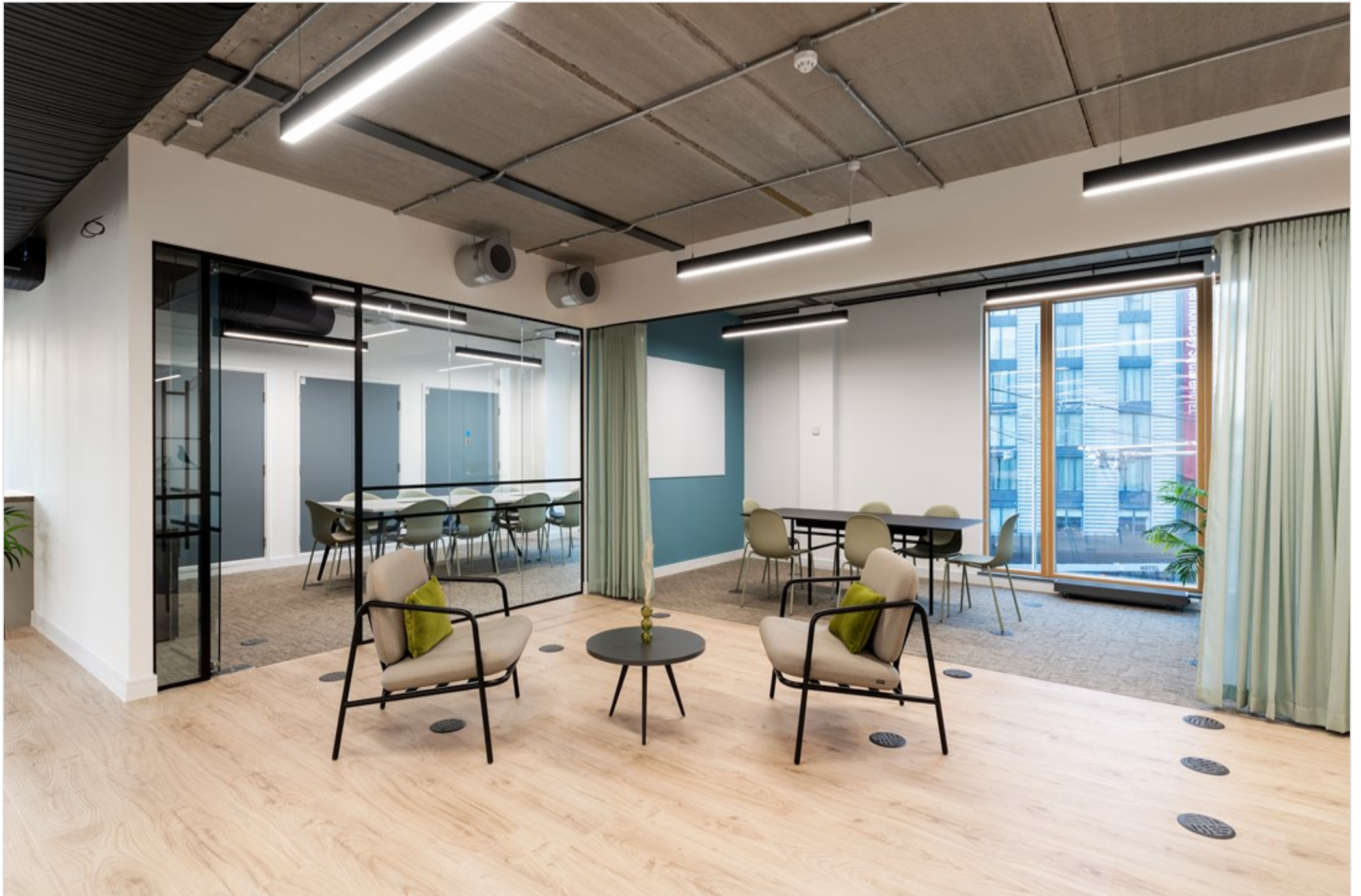
12-15 Bermondsey Square, London, SE1 3UN