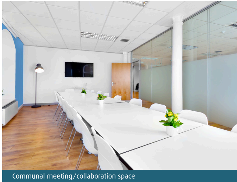
Communal meeting/collaboration space