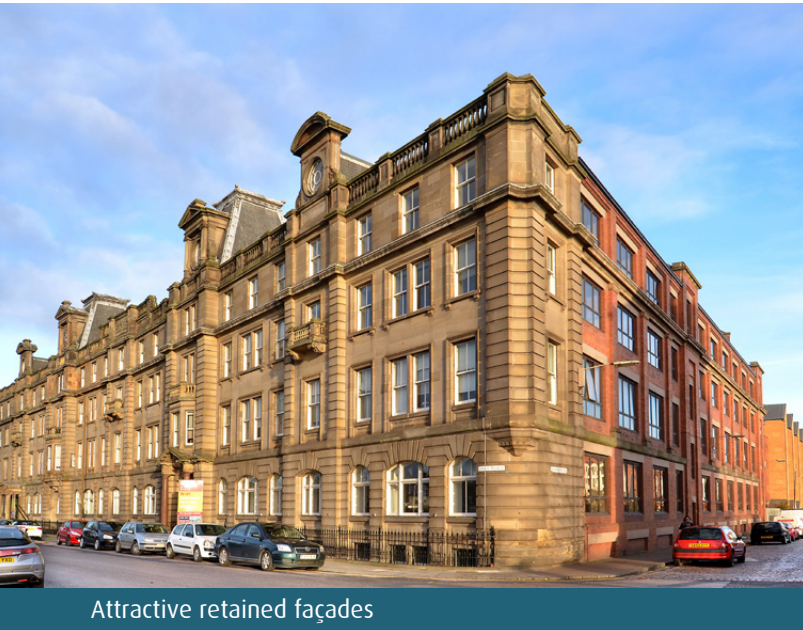
Attractive retained façades

The programme of regeneration in Leith has already seen the revival of this community within the City, which is now complete with housing, leisure and shopping amenities, upmarket bars and restaurants and new education and health facilities. The extension of Edinburgh Tram through Leith will make a huge difference to Leith's connectivity to the city centre, west Edinburgh and Edinburgh International Airport.