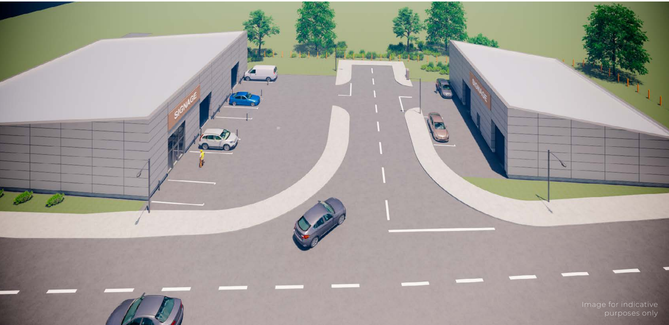
Image for indicative purposes only