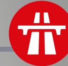
M25 J7 8 Miles