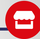
Croydon Shopping Centre 1.5 Miles