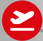
Gatwick Airport 18 Miles