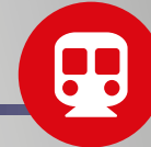
Waddan Train Station 6 Minutes' Walk