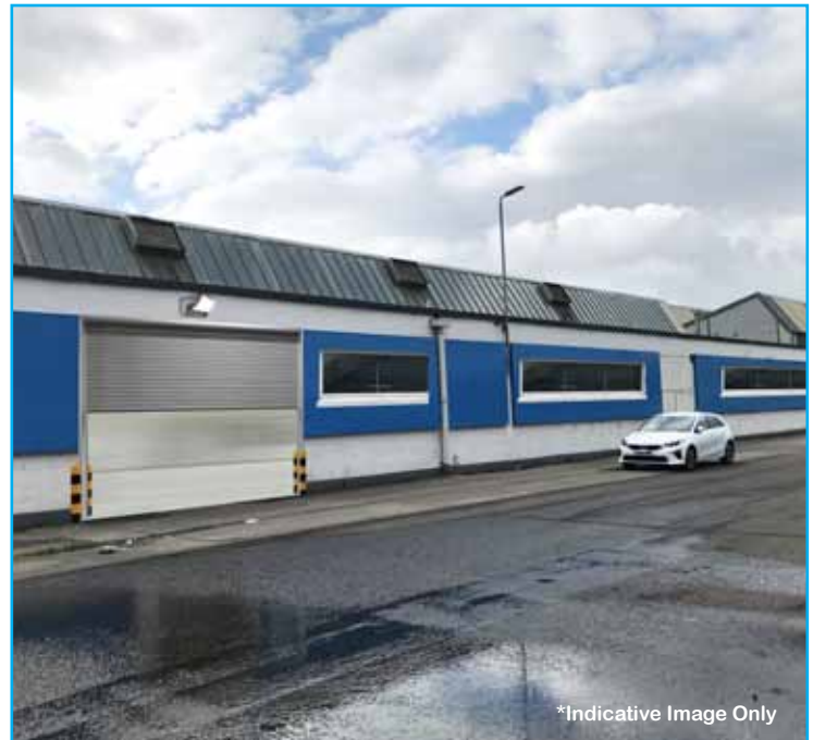
*Indicative Image Only

All prices are quoted exclusive of VAT. VAT will be payable at the prevailing rate.