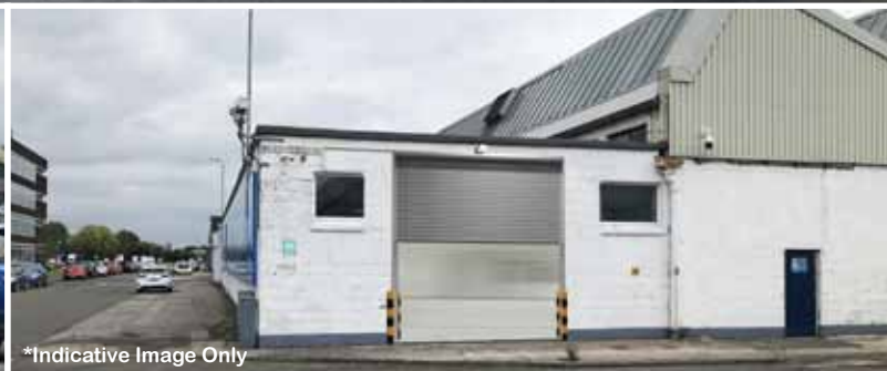
*Indicative Image Only