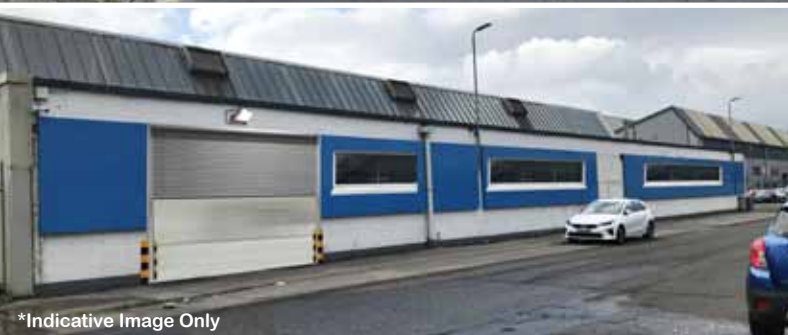
*Indicative Image Only