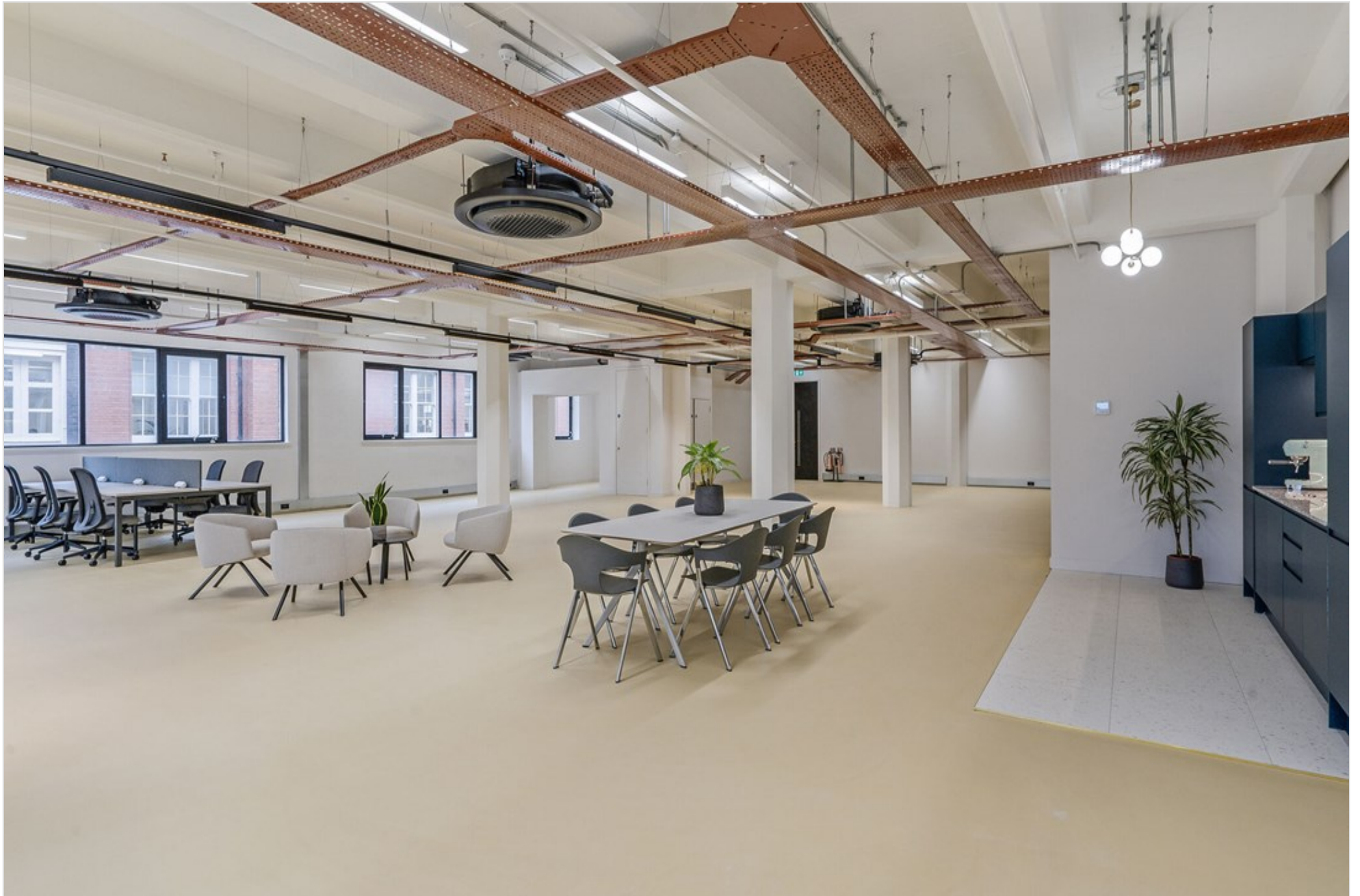
Harling House, 47-51 Great Suffolk Street, London, SE1 0BS