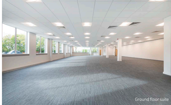
Ground floor suite