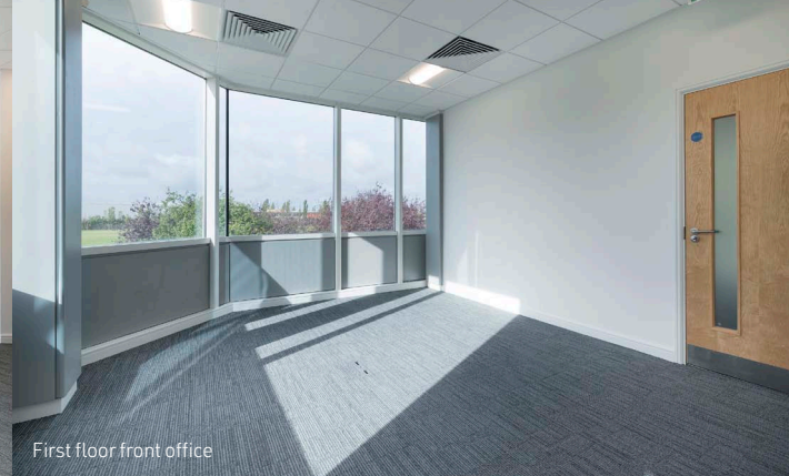
First floor front office