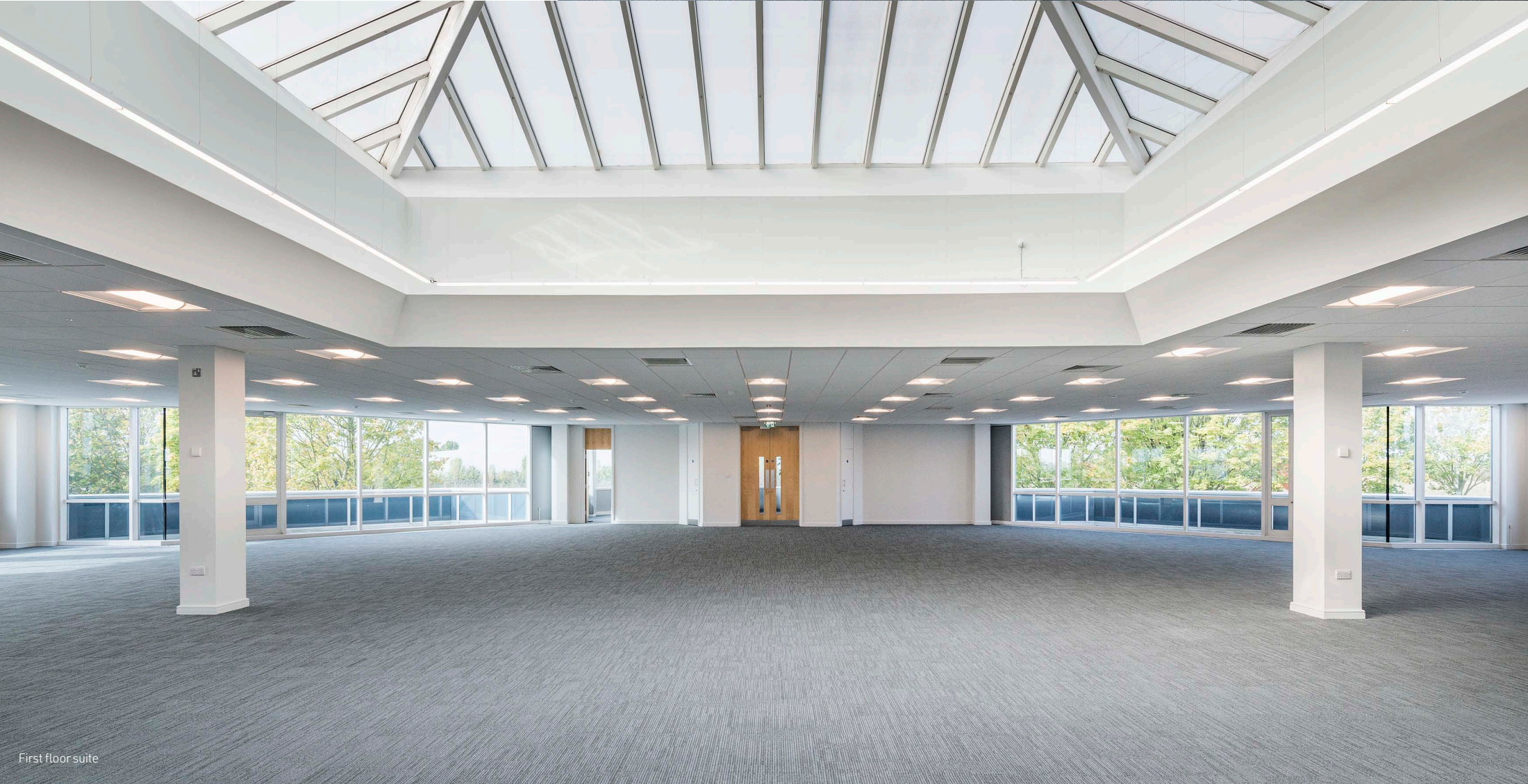
First floor suite