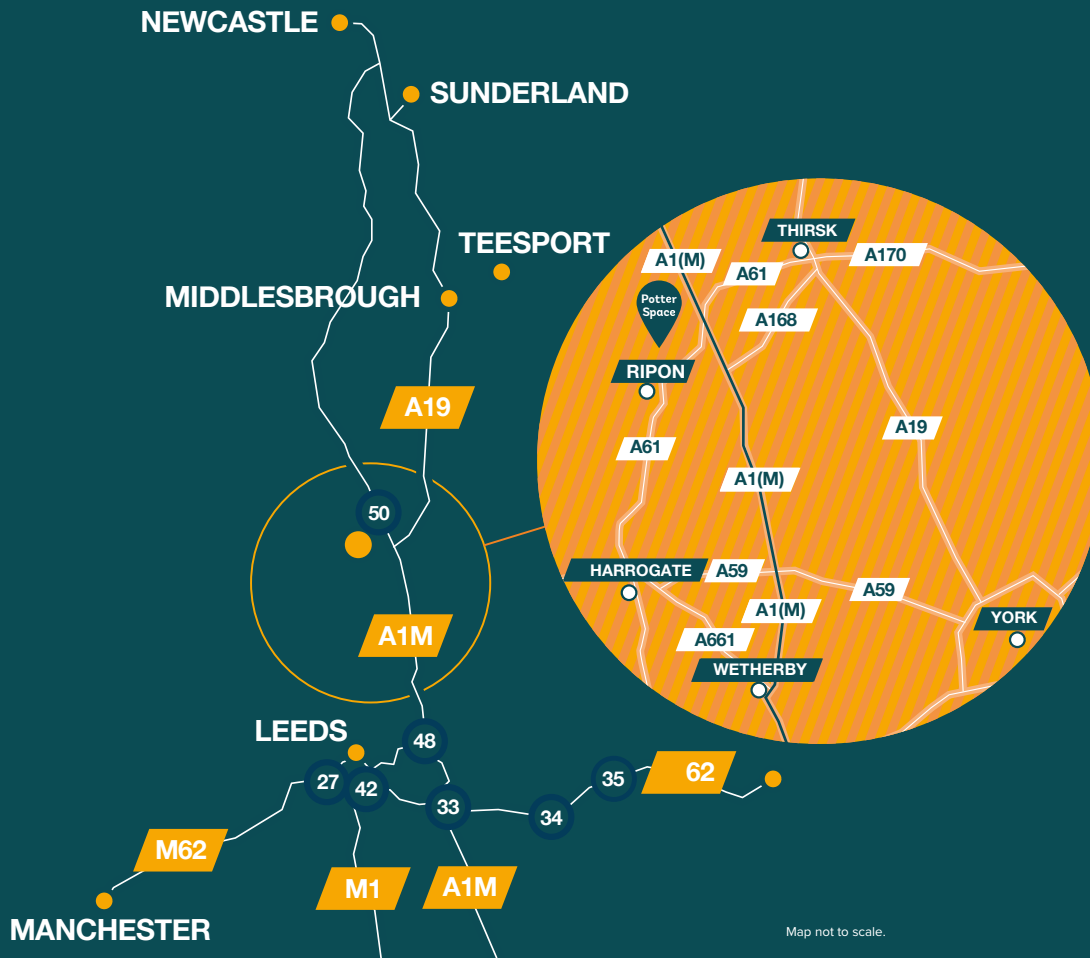
Map not to scale.