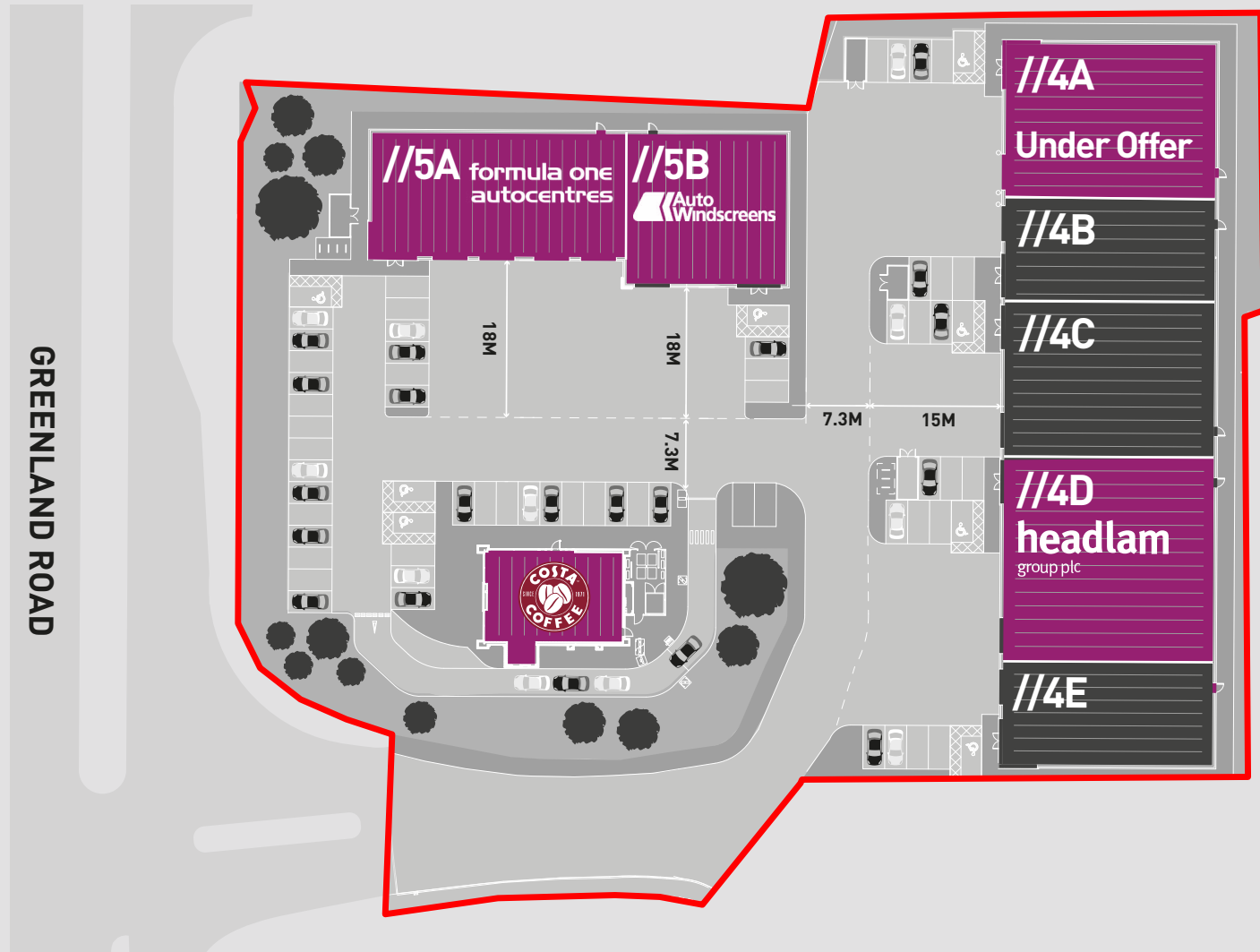
PROPOSED LAYOUT PLAN, NOT TO SCALE