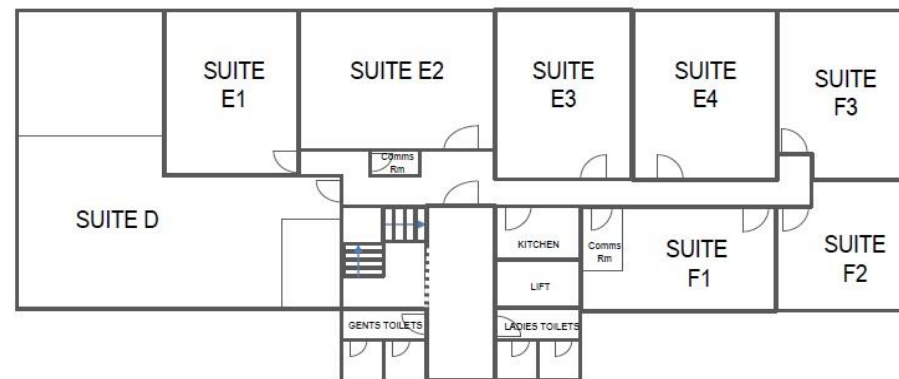
RIVERVIEW HOUSE - FIRST FLOOR