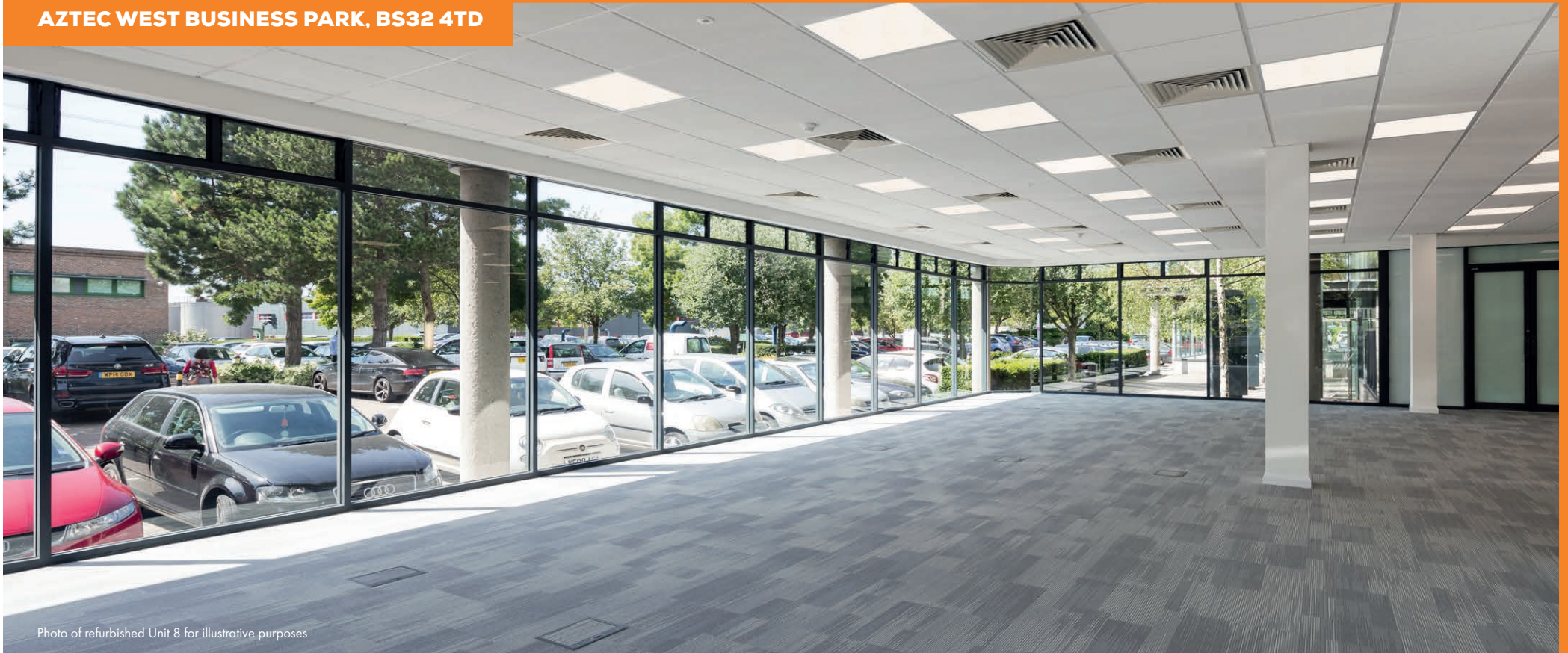
Photo of refurbished Unit 8 for illustrative purposes

NEWLY REFURBISHED GROUND FLOOR OFFICE SUITES TO LET FROM 508 - 3,456 SQ FT