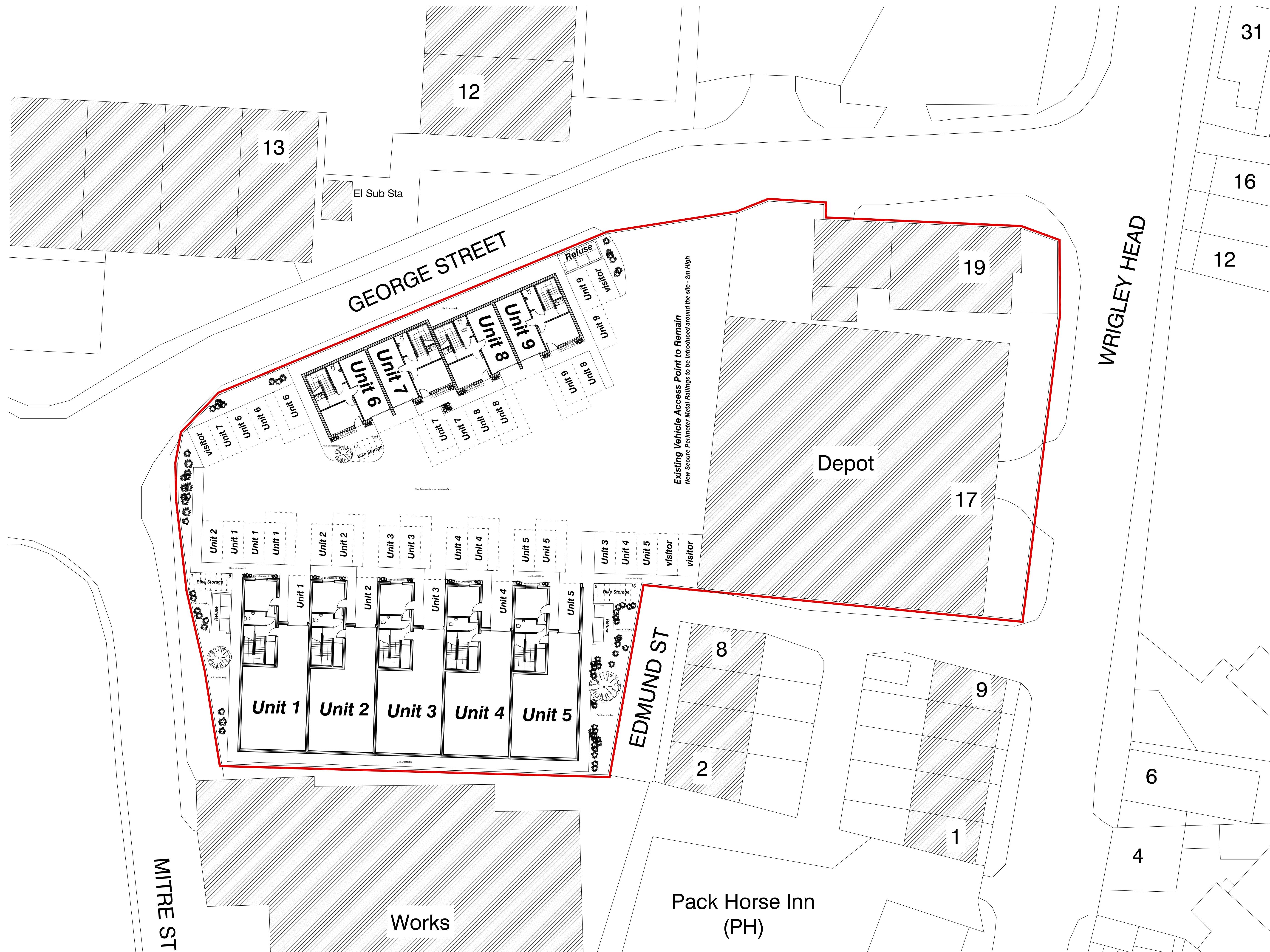
PROPOSED SITE/LOCATION PLAN scale 1:200