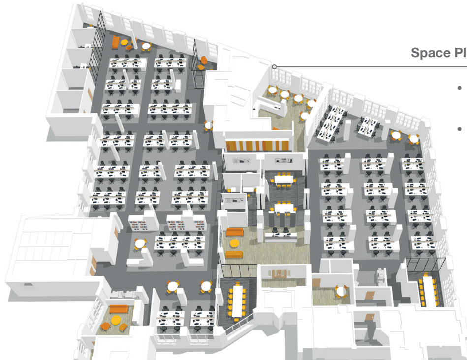
Floor 2 Space Plan 1:8 sq m