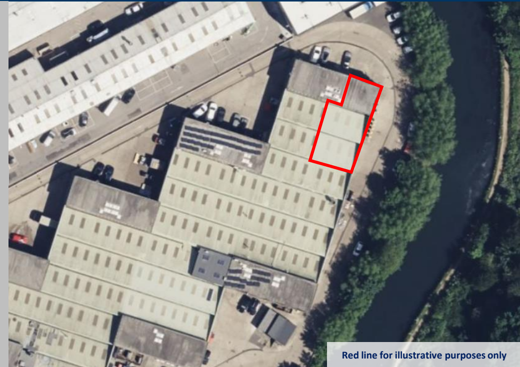
Red line for illustrative purposes only