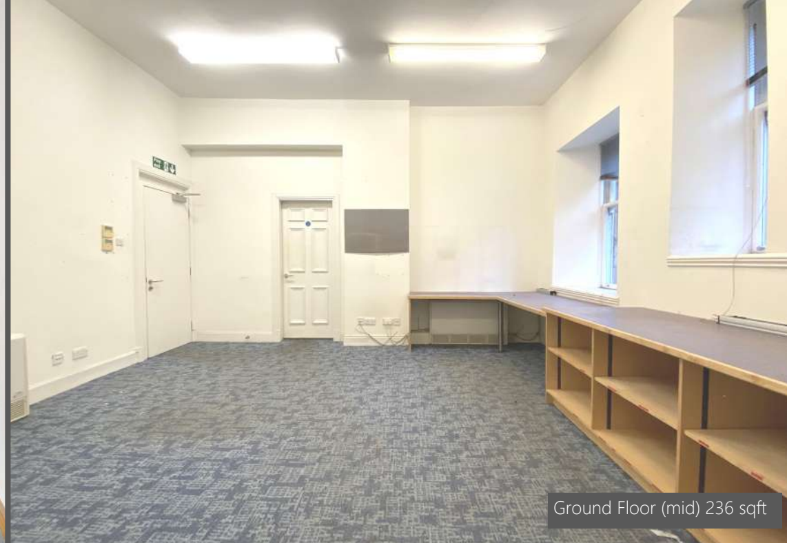
Ground Floor (mid) 236 sqft