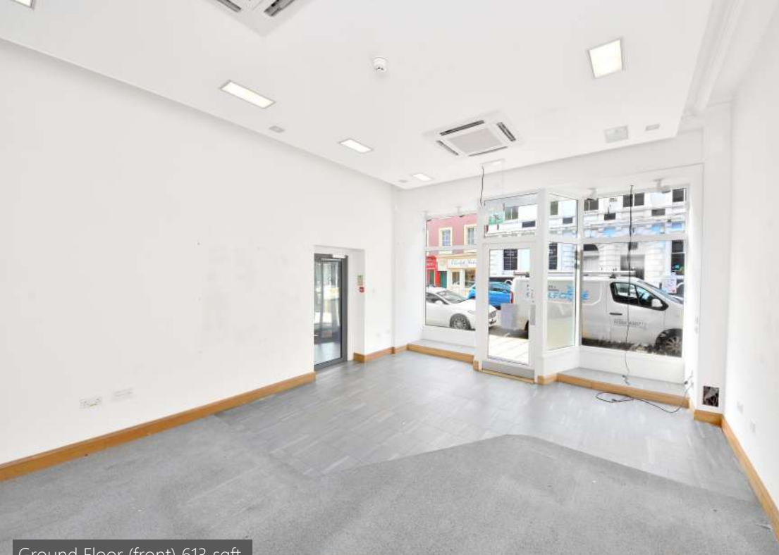
Ground Floor (front) 613 sqft