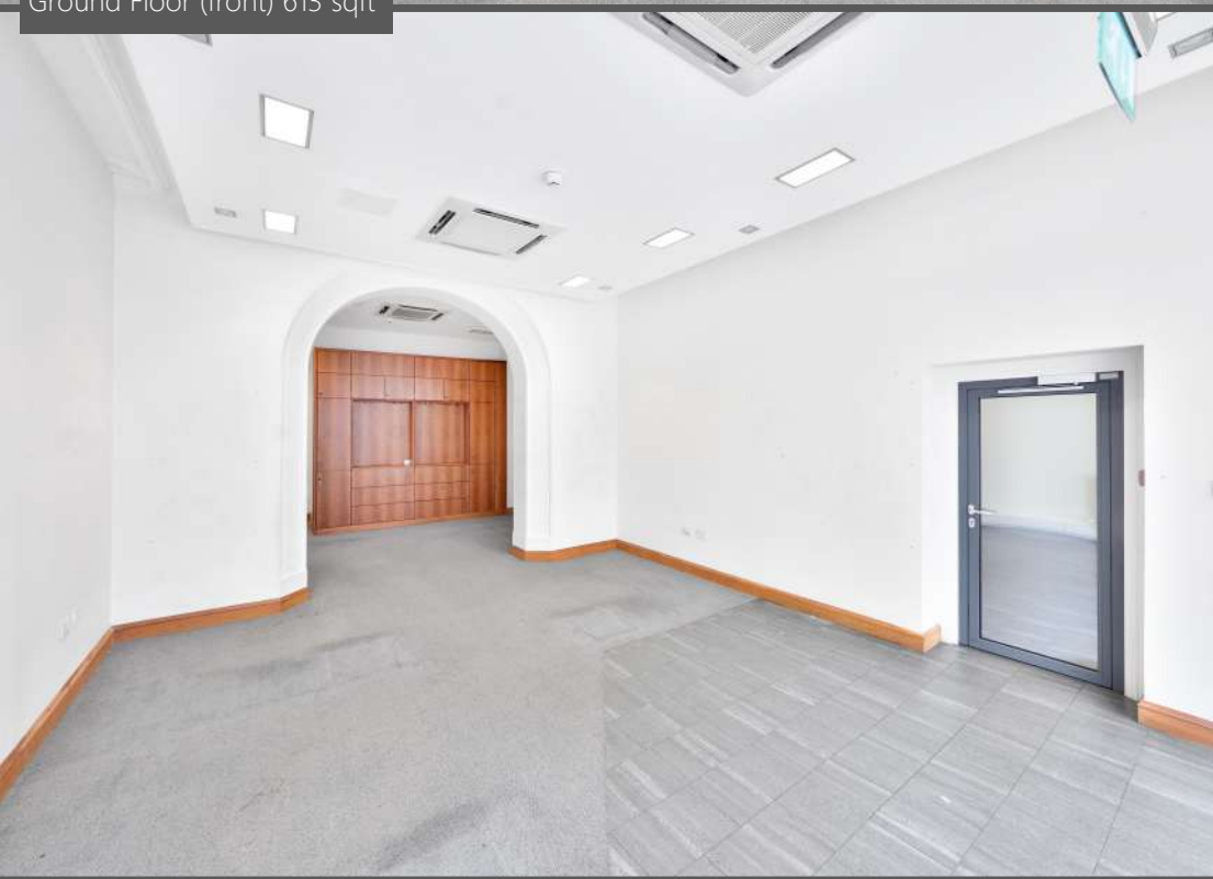
Ground Floor (back) 613 sqft