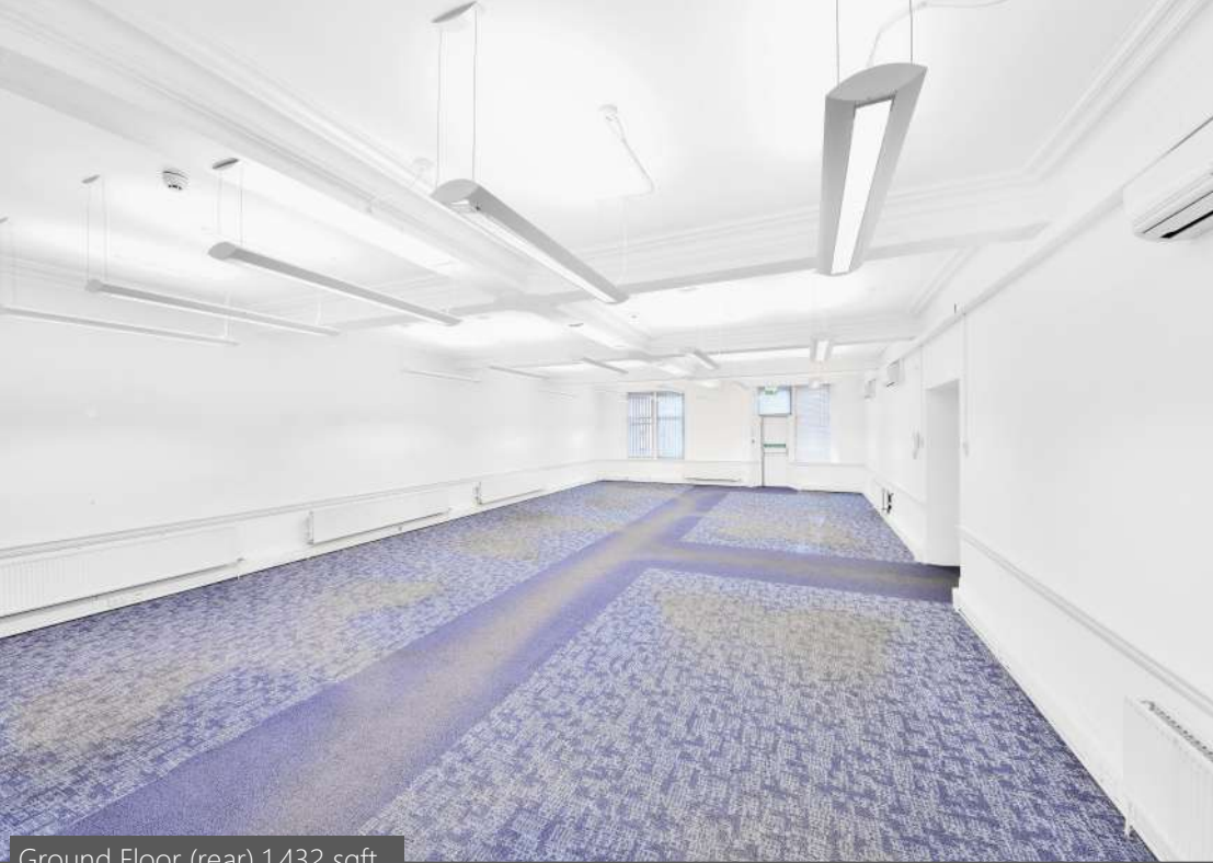
Ground Floor (rear) 1,432 sqft