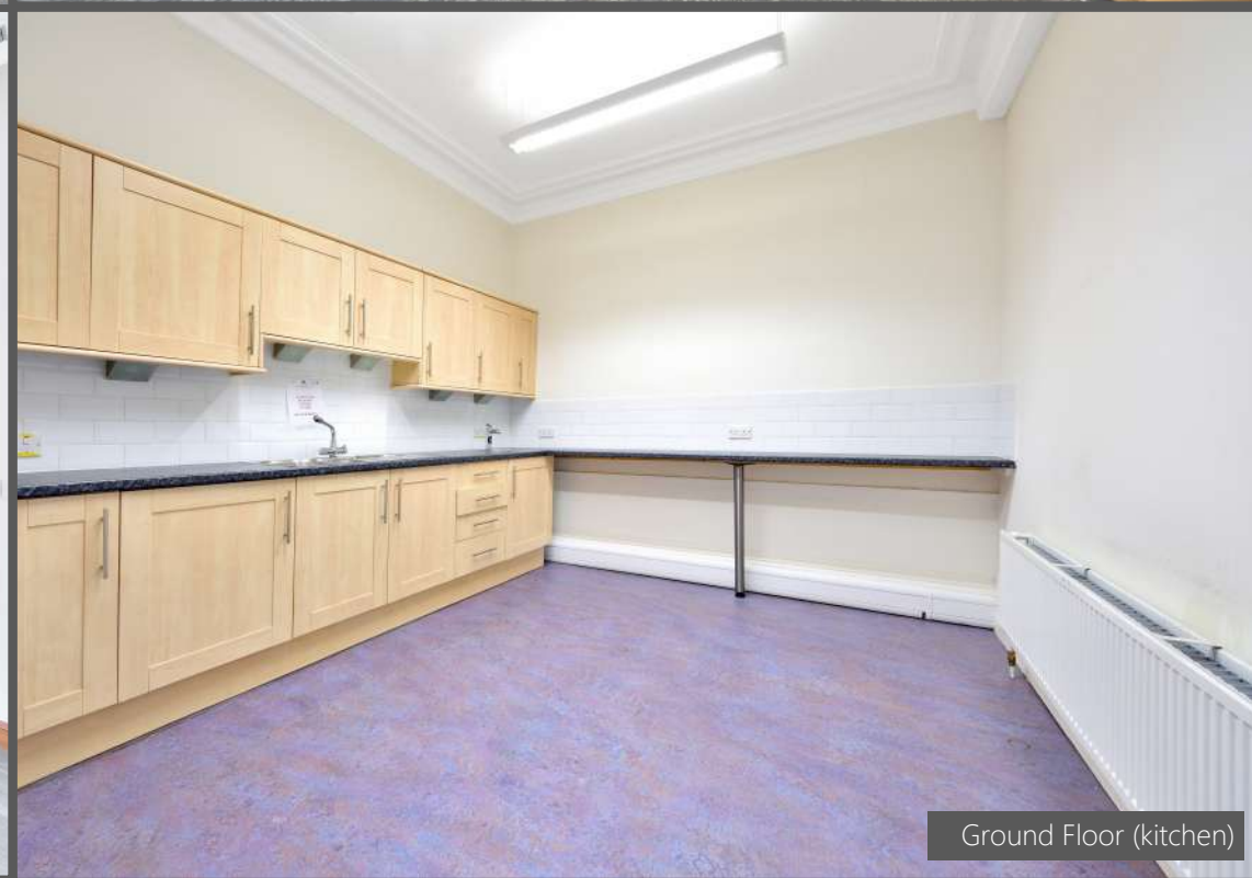
Ground Floor (kitchen)