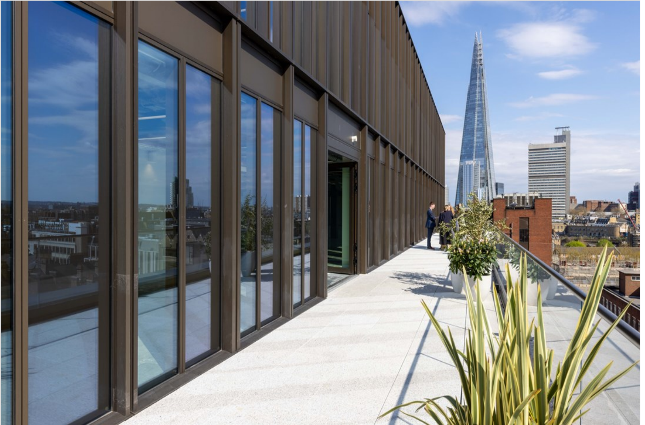
The Forge , 105 Sumner Street, London, SE1 9HZ