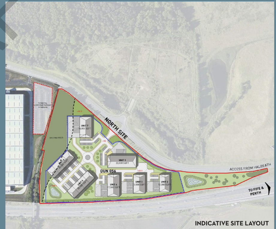
INDICATIVE SITE LAYOUT