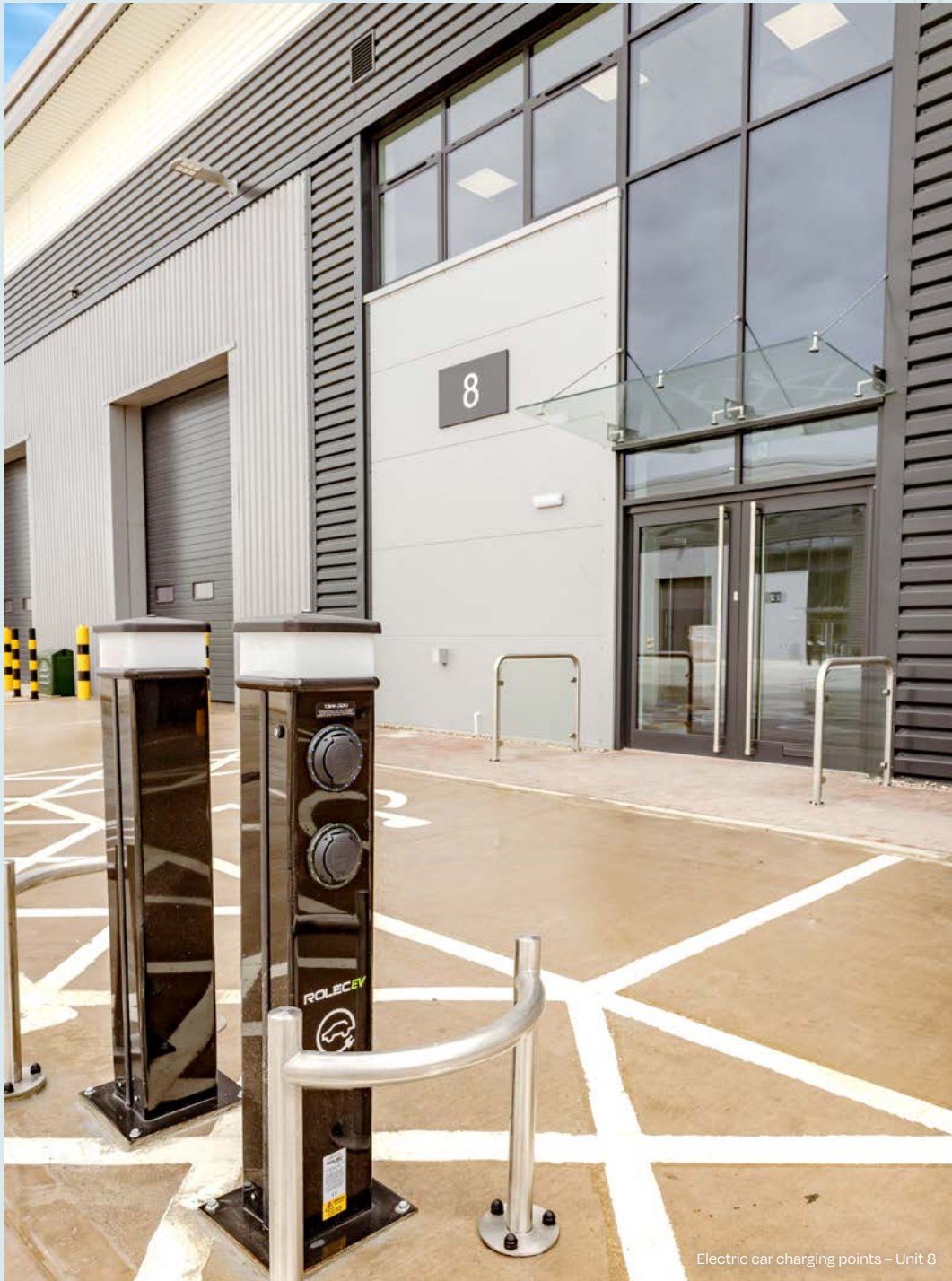
Electric car charging points - Unit 8