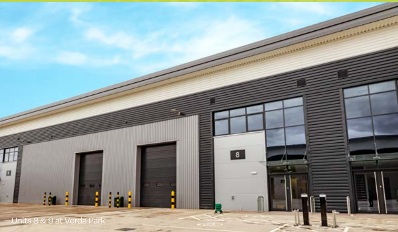
Units 8 & 9 at Verda Park