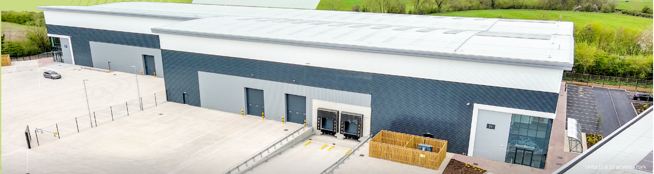
Units 11 & 12 at Verda Park