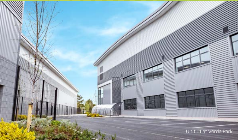
Unit 11 at Verda Park