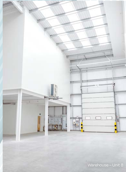
Warehouse - Unit 8