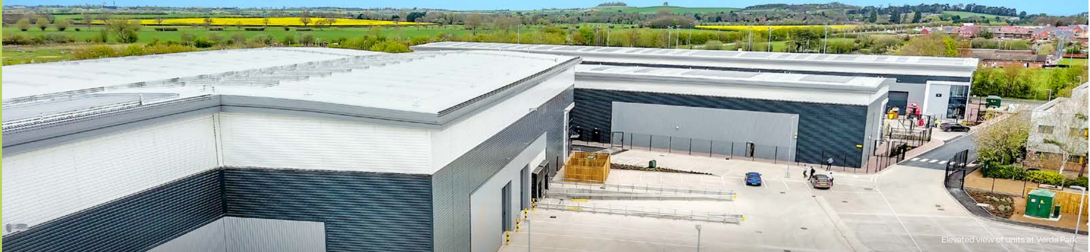
Elevated view of units at Verda-Park