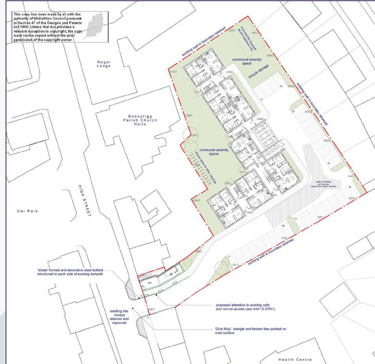
Site layout plan - 23 flatted units