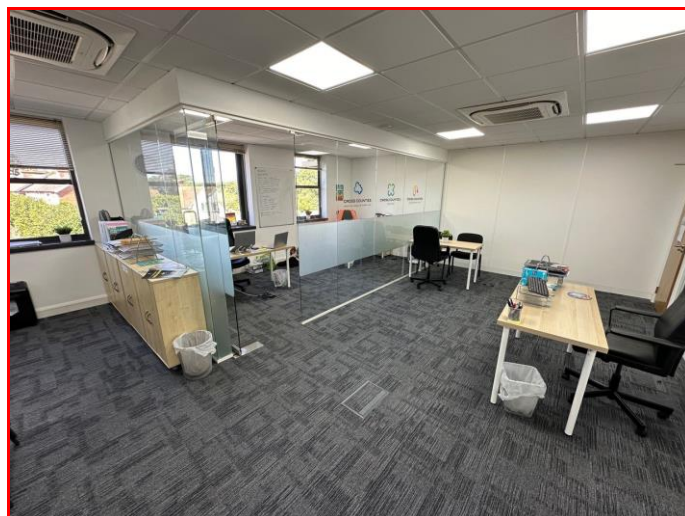
Second Floor Office Suite