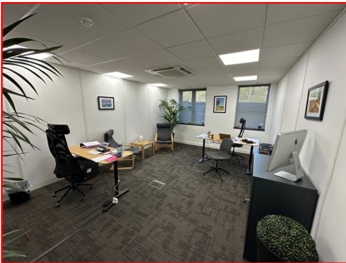
Example of Ground Floor Office Suite

Currently there are 2 office suites available on the ground floor and 1 on the second floor. Pictures included in order to give you an idea of the quality of space being offered.