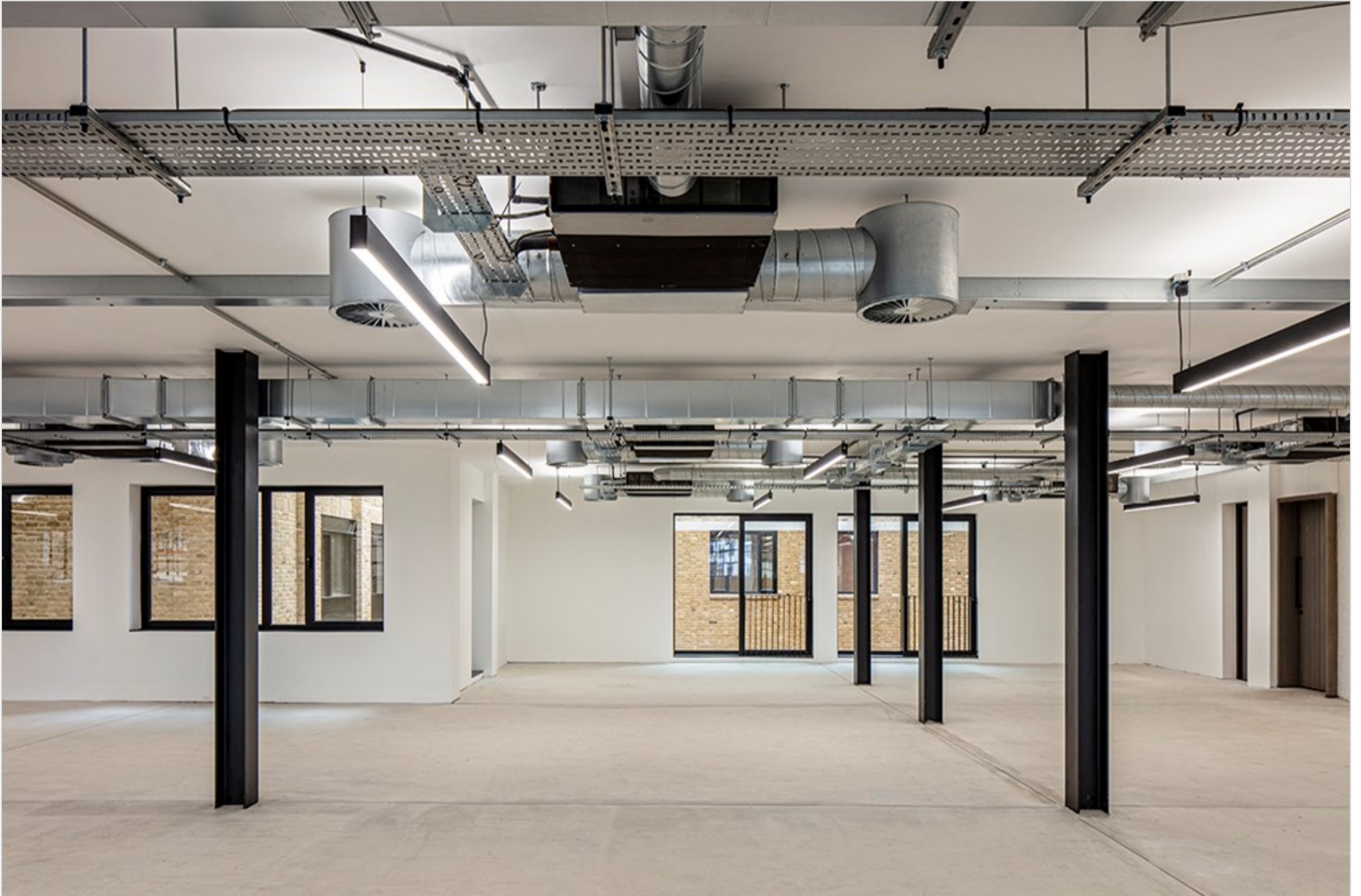
Great Suffolk Yard, 127 - 131 Great Suffolk Street, London, SE1 1PP