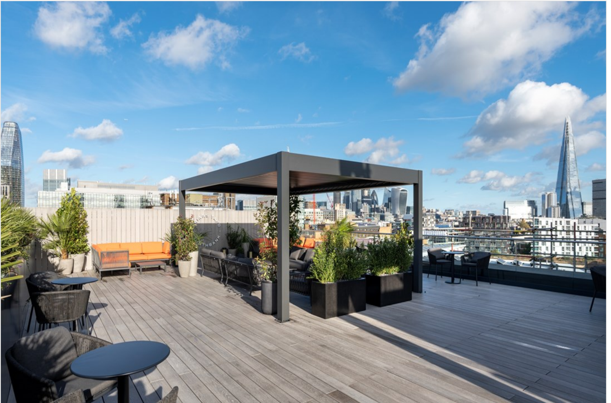
Friars Yard, 160 Blackfriars Road, London, SE1 8EZ