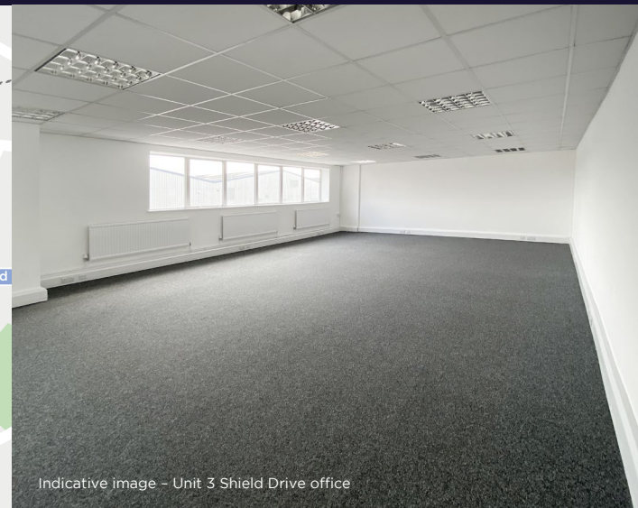
Indicative image - Unit 3 Shield Drive office